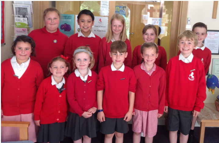
Tysoe School Council