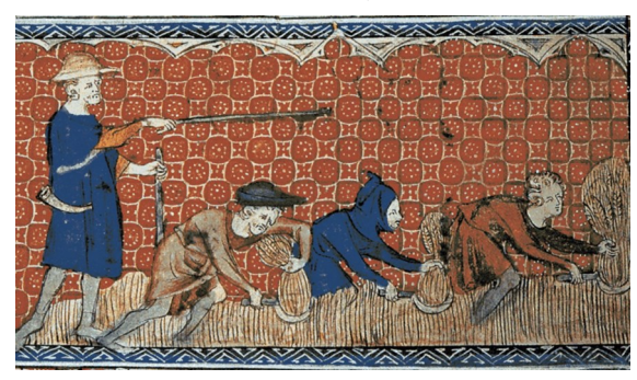
'British Library, Queen Mary's Psalter'.

The recorded names of Tysoe's medieval inhabitants provide insights, as until the early fourteenth century they often recalled the origins and occupation of an individual or their forebears. Some incorporated landscape features into their names, like bridges, wells, mills and woodland. Many people migrated into Tysoe, coming mostly from within ten miles, but others came from further afield, in Warwickshire and beyond. With tracts of land awaiting full